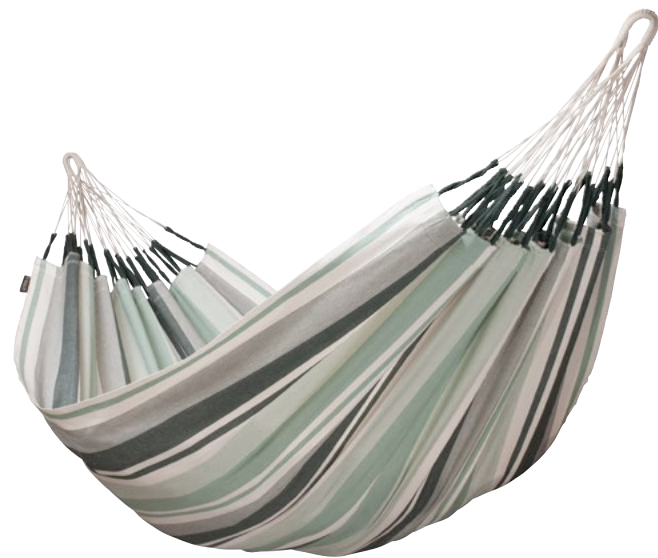
Double Hammock Paloma olive PAH16-4